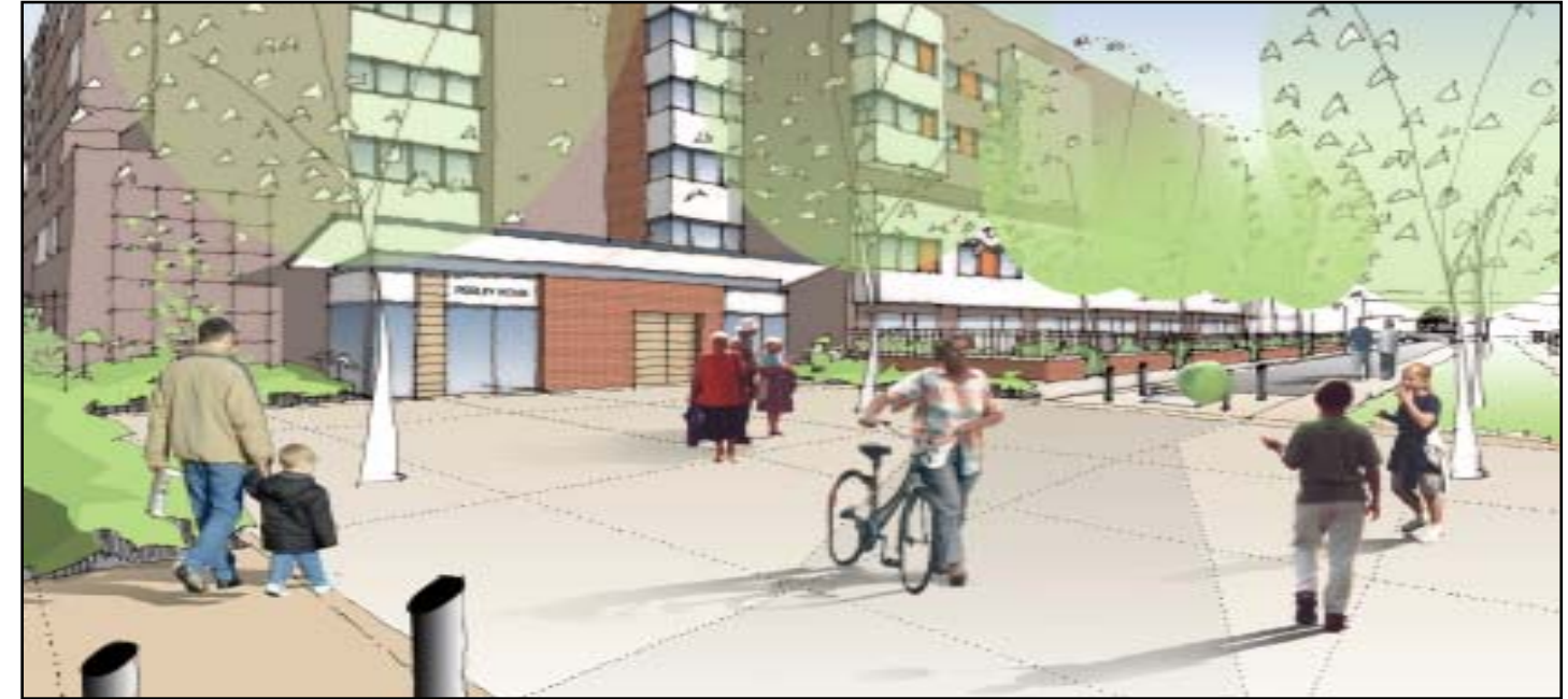
Look into the future - an artist impression on what Leopold could look like